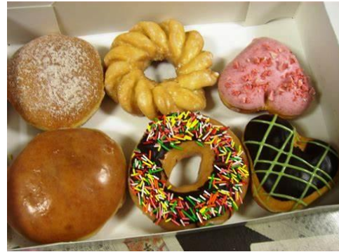
File:Krispy Kreme Doughnuts IPG -