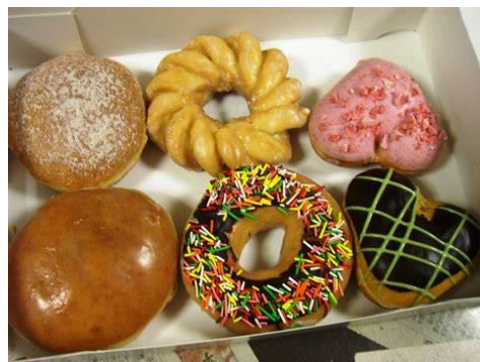
File:Krispy Kreme Donohnuts IPG -